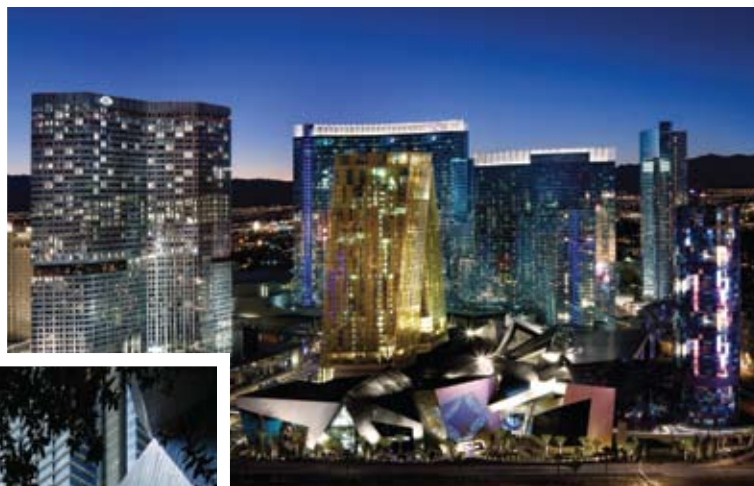
The bright lights of the CityCenter are a stunning addition to the Las Vegas skyline.