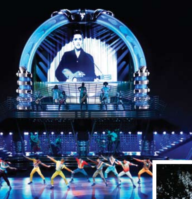
Cirque du Soleil's new Viva Elvis show celebrates the legendary showman.