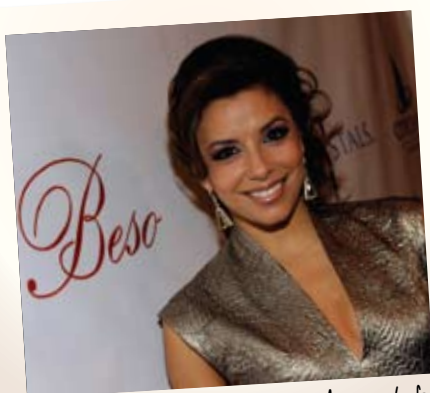
Eva Longoria Parker on the red carpet for the opening of her new Latin steakhouse, Beso, at Crystals.

The locals have jokingly labelled this new addition Gotham City, for The Crystal's